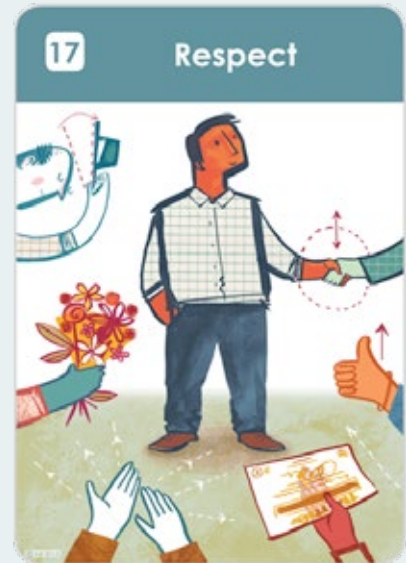
Click the image to view the video

What could you do over the next few days towards making this happen?