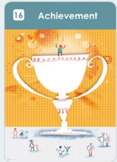
Click the image to view the video

What you do over the next few days to help this to happen?