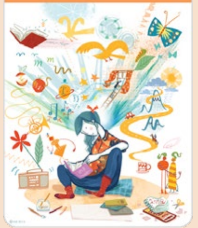
Click the image to view the video